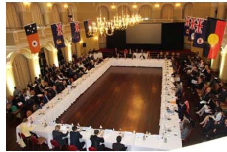
AG Plenary, Perth June 2015